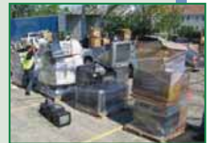
Electronics Recycling by eWorks Electronics Services