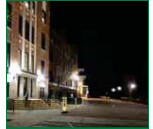
Upgrading to LED bulbs in the pole lights at the Kane County Government Center reduced the electricity consumption of those fixtures by over 75%.

Sustainability efforts stretch across all County government operations—including reducing energy and water consumption at the County's two dozen facilities, revising purchasing procedures and contracts to make a shift toward using more eco-friendly products and services, and taking steps to make the County's fleet of nearly 300 vehicles more fuel-efficient.