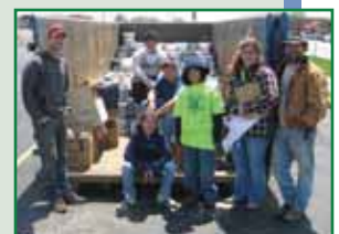
Latex Paint recycling by Earth Paint Collection Systems