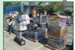
Electronics Recycling by eWorks Electronics Services