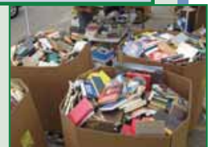
Book Recycling by Pacesetter Books

Please call 630-208-3841 or email recycle@countyofkane.org to sign up to be mailed a paper copy of the Guide each year.