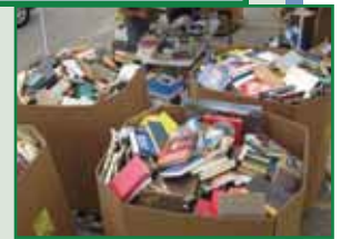
Book Recycling by Pacesetter Books

Please call 630-208-3841 or email recycle@countyofkane.org to sign up to be mailed a paper copy of the Guide each year.