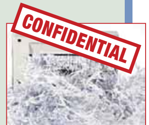
On-site document shredding truck